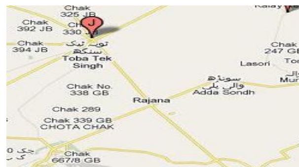
Fig 1 Map of Site of survey

ethnomedicinal knowledge about the wild plants of District Toba Tek Singh Pakistan.