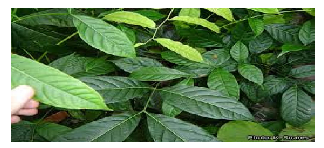
Figure 1: Leaf of Swietenia macrophylla King

In macroscopical studies of the leaf, it were found that it's shape was usually oblong to oblonglanceolate or ovate-lanceolate with acute apex and entire margins, varying in size from 5-7cm wide and 16-30 cm in long. The leaves are alternate with leaflets opposite or occasionally changed. Colour was dark glossy green (upper surface), light green (lower surface), upper surface was smooth and lower surface was slightly rough, odour was characteristic, taste was pungent bitter (Fig. 1).